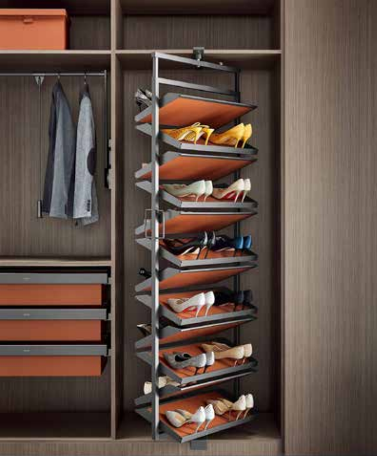
360° Rotatable Multi-Layer Shoe Rack