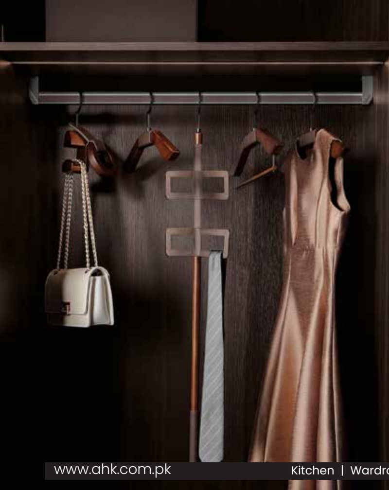
Clothes Hanger Set